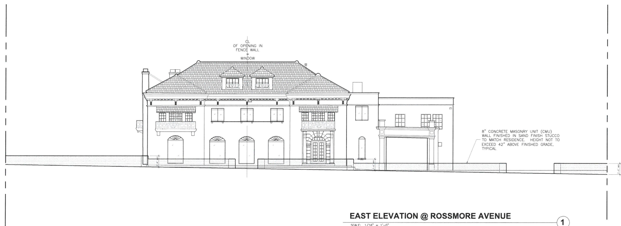
EAST ELEVATION @ ROSSMORE AVENUE